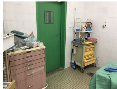
(Left) X-ray unit installed donated by Curry General Hospital.