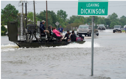
Hurricane Harvey Victims Rescued.

In recognition of events in North America, RI has created two Donor-Advised Funds under The Rotary Foundation available to accept contributions for hurricane relief: The Gulf Coast Disaster Relief DAF was established to assist communities devastated by Hurricane Harvey . The Hurricane Emergency Relief DAF is accepting contributions for Hurricane Irma disaster recovery.